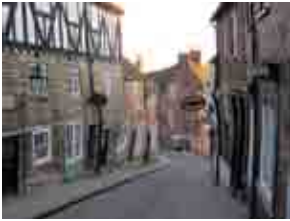
Early stages of wet AMD