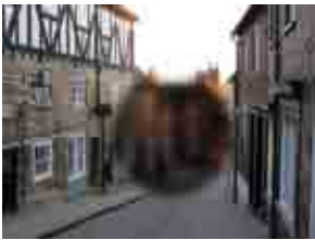
Advanced stages of AMD (wet and dry)